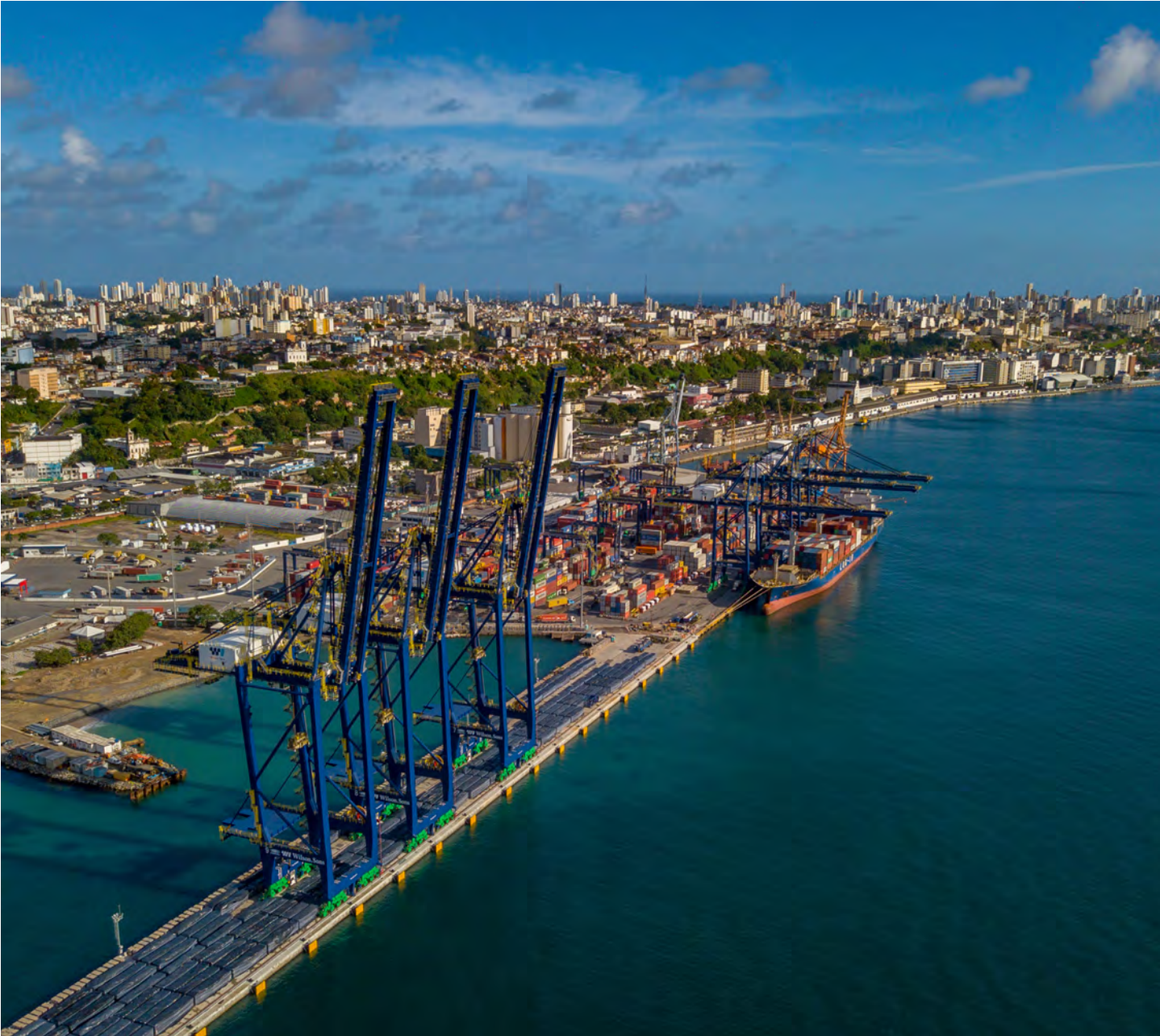
Salvador Container Terminal.