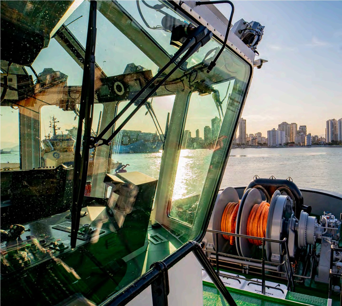
WS Tugboat in Guarujá II Shipyard.