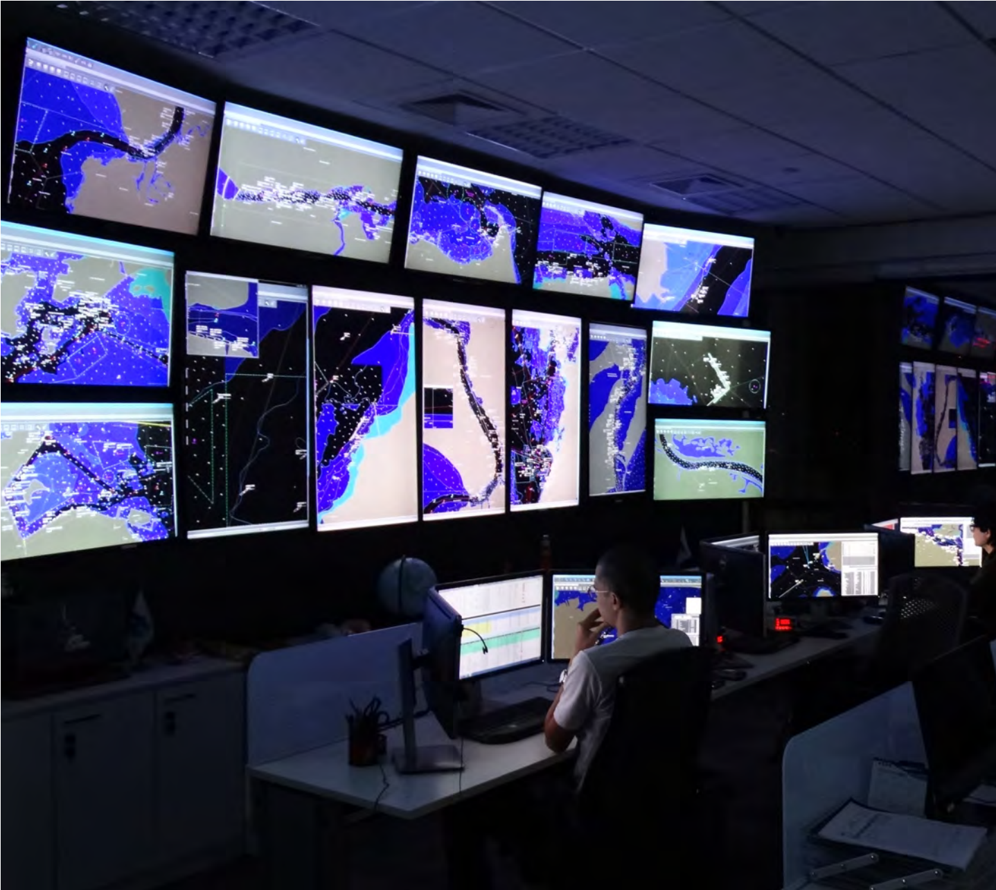
Tugboat Operations Centre ("COR").